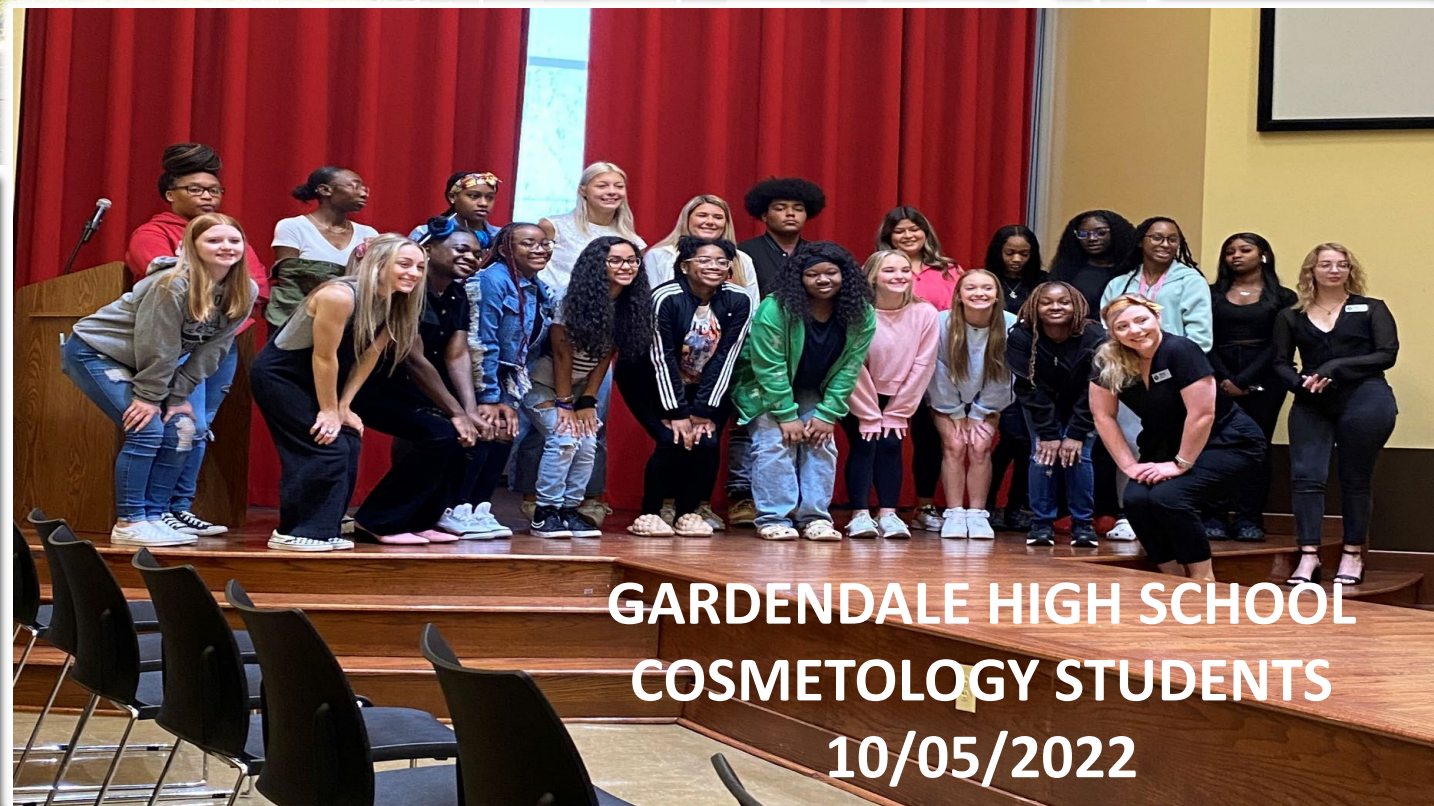
GARDENDALE HIGH SCHOOL COSMETOLOGY STUDENTS 10/05/2022